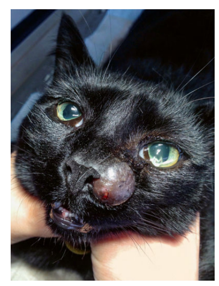
Figure 1: Cat at first presentation with a bulging mass measuring 1 cm in diameter.

The excised material was fixed in 4% buffered formalin for 24h, dehydrated in a 70-95% ethanol series, followed by Xylol and paraffin embedding. Sections (2 to 3 μm) were mounted on glass slides and stained with Haematoxylin-Eosin (HE) using standard procedures. Histologically the mass consisted of spindeloid to stellate cells expanding the dermis and subcutis and was intimately associated with to the epidermis. The neoplastic cells were oval to spindeloid with moderate amounts of pale basophilic cytoplasm with indistinct cell borders (Fig. 4) and round to oval nuclei showing a finely stippled chromatin pattern and only slightly visible nucleoli, moderate anisocytosis, anisocaryosis and anisonucleoliosis. The neoplastic cells were embedded in abundant extracellular matrix (mucopolysaccharides), separating the adnexa and often forming whorls around small blood vessels or hair follicles. The mitotic rate was moderate with 11 mitotic figures in 10 high power fields. Within the tumour were small areas of