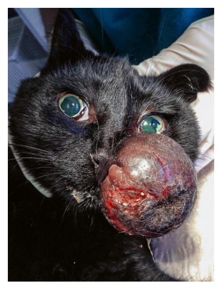
Figure 2: The cat at the second presentation 2 month after the first treatment attempt. The mass grew up to 5 cm in diameter.