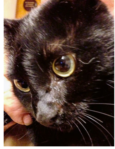
Figure 3: Complete healing of the operation field 6 months after the closure of the suture dehiscence.